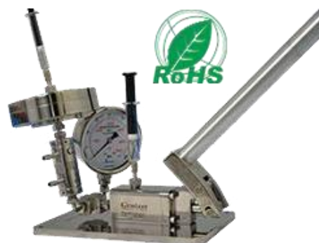
Homogenizer with Extruder